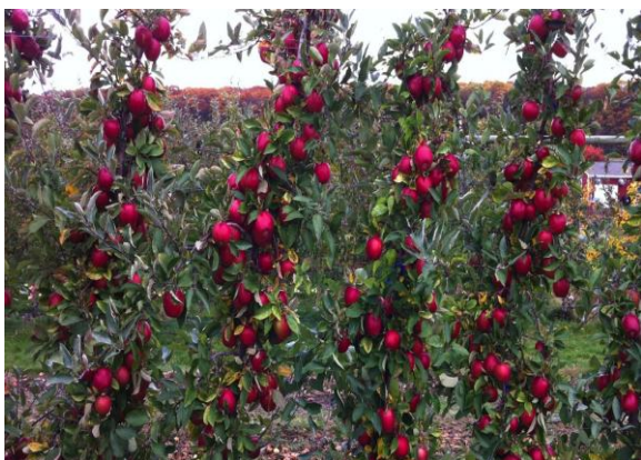
HIGH DENSITY IN APPLE